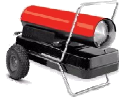
“Torpedo”-style Forced-Air Heater

“ What if you could purchase a superior heater that, in it's FIRST year, ended up saving you money? ”