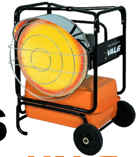
VAL6 Radiant Heater